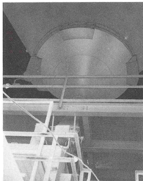
The Bin Activator is a patented vibrating discharger which is flexibly mounted to the bottom of a silo. Its maintenance requirements are minimal and energy requirements low.