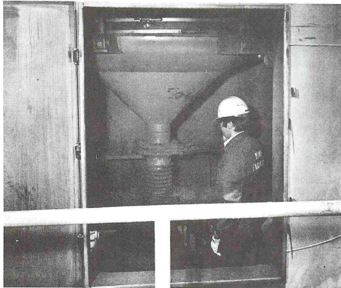
A 6-ft. diameter Bin Activator provides a totally enclosed system which ends fluidization and dust problem.