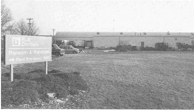
Random & Randolph solved its silica dust problem on a new mixing system with one Vibra Screw Bulk Bag Unloader.

Random & Randolph is a division of Dentsply Corporation. It's Maumee, Ohio plant produces silica-based compounds for investment castings.