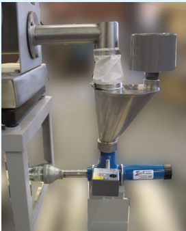
Eductor and Wetting Cone Systems