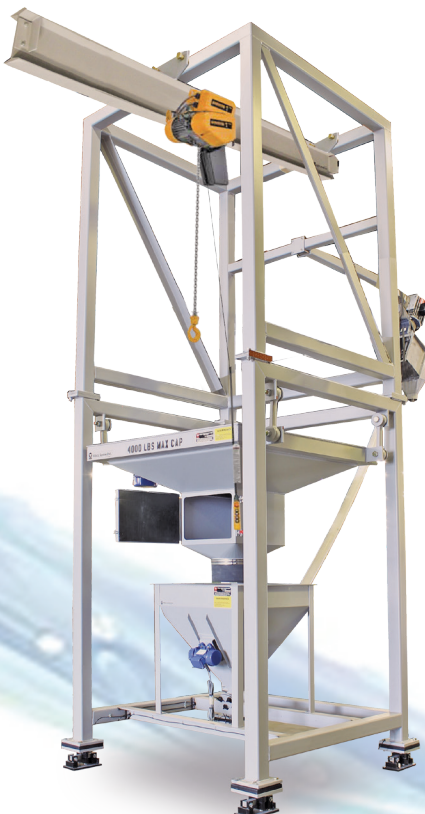
Bulk Bag Unloaders with flexible incline screw conveyors