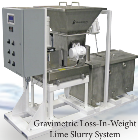
Gravimetric Loss-In-Weight Lime Slurry System