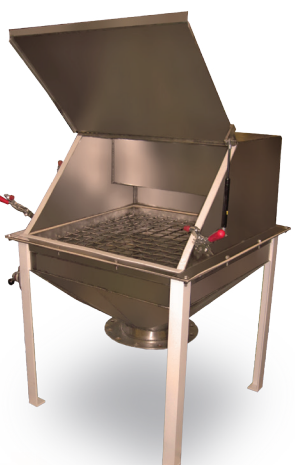
Paper sack and container dump stations