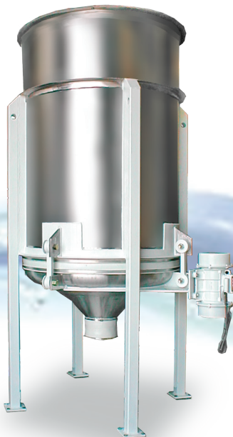
Material storage silos & bins