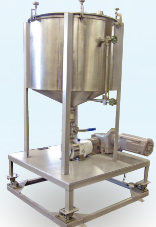
Batch Mix Tanks