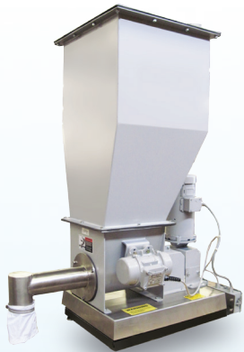
Gravimetric Loss-In-Weight Feeders