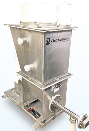
Volumetric Screw Feeders