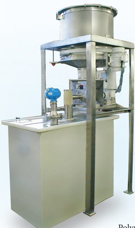
Polymer batch mixing system