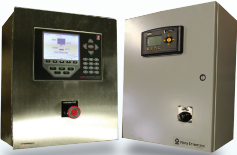
System & Process Control Packages