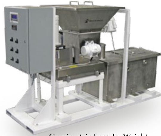
Gravimetric Loss-In-Weight Lime Slurry System