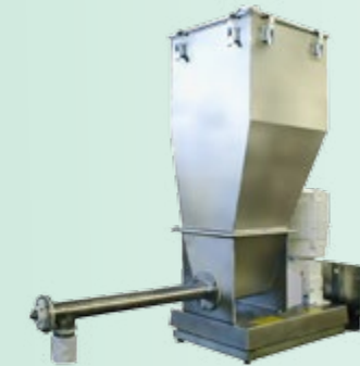
Gravimetric Loss-In-Weight Feeders