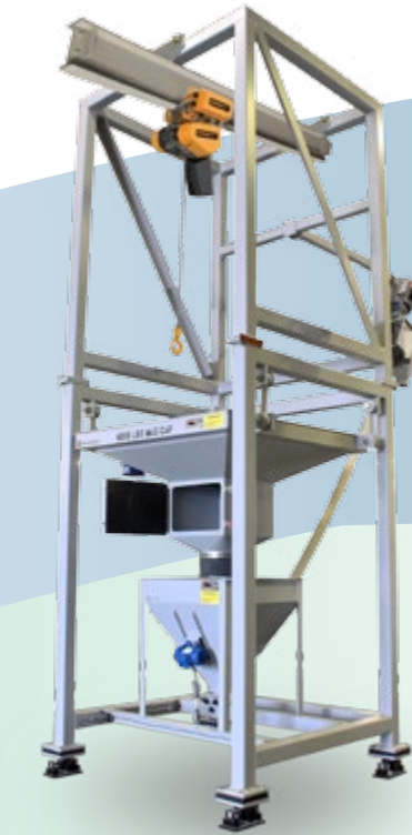
Bulk Bag Unloaders with flexible incline screw conveyors