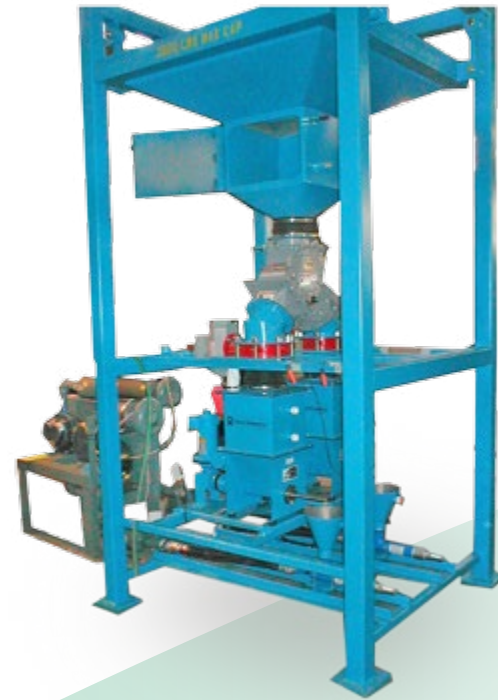
Powder Activated Carbon (PAC) system with Bulk Bag Unloader, Volumetric Feeders, and eductor pneumatic conveying system