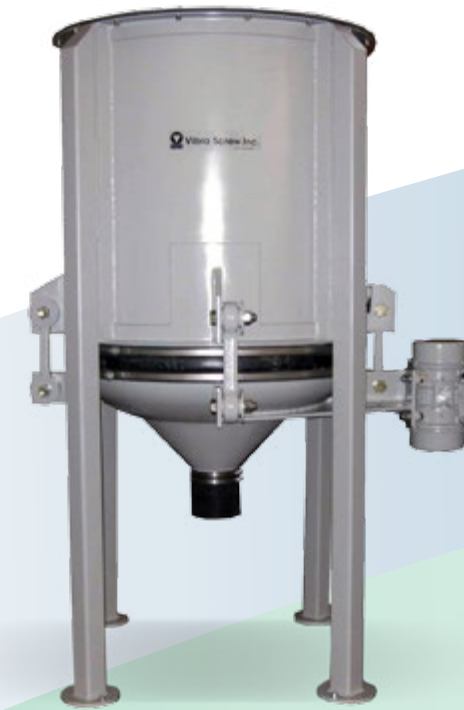
Material storage silos & bins