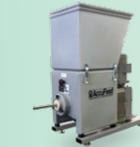
Volumetric Screw Feeders