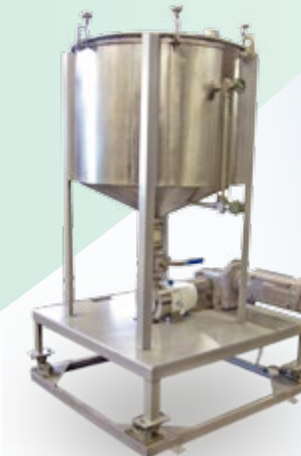
Batch Mix Tanks