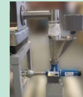
Eductor and Wetting Cone Systems