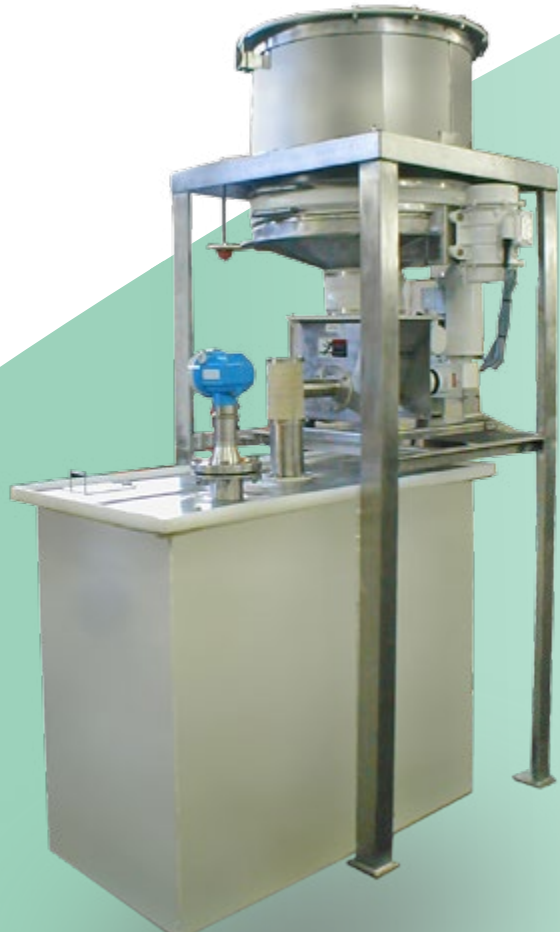
Polymer batch mixing system