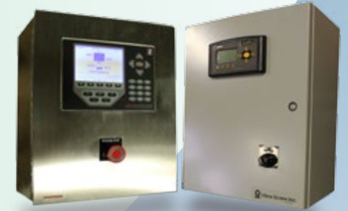
System & Process Control Packages