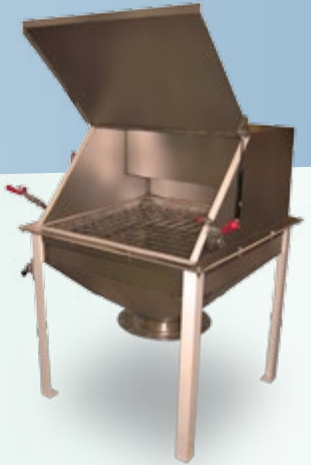
Paper sack and container dump stations